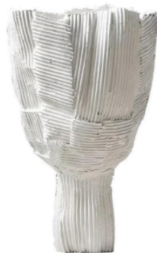
PORTRAIT BY MALI AZIMA